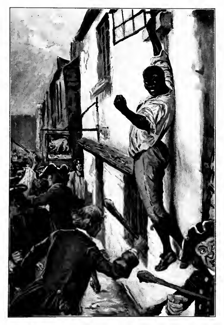
THEN FOR A MOMENT HE HUNG, CLINGING BY ONE HAND TO THE WINDOW.